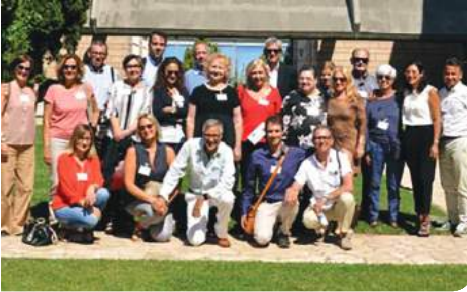
People from across Italy gathered for ALCASE's national meeting.

ALCASE of Italy held a successful fifth national meeting for people with lung cancer and their caregivers in Rome in September.