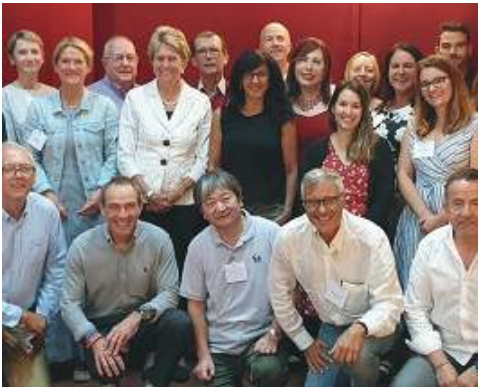
GLCC members gather for our 2019 annual meeting in Barcelona.